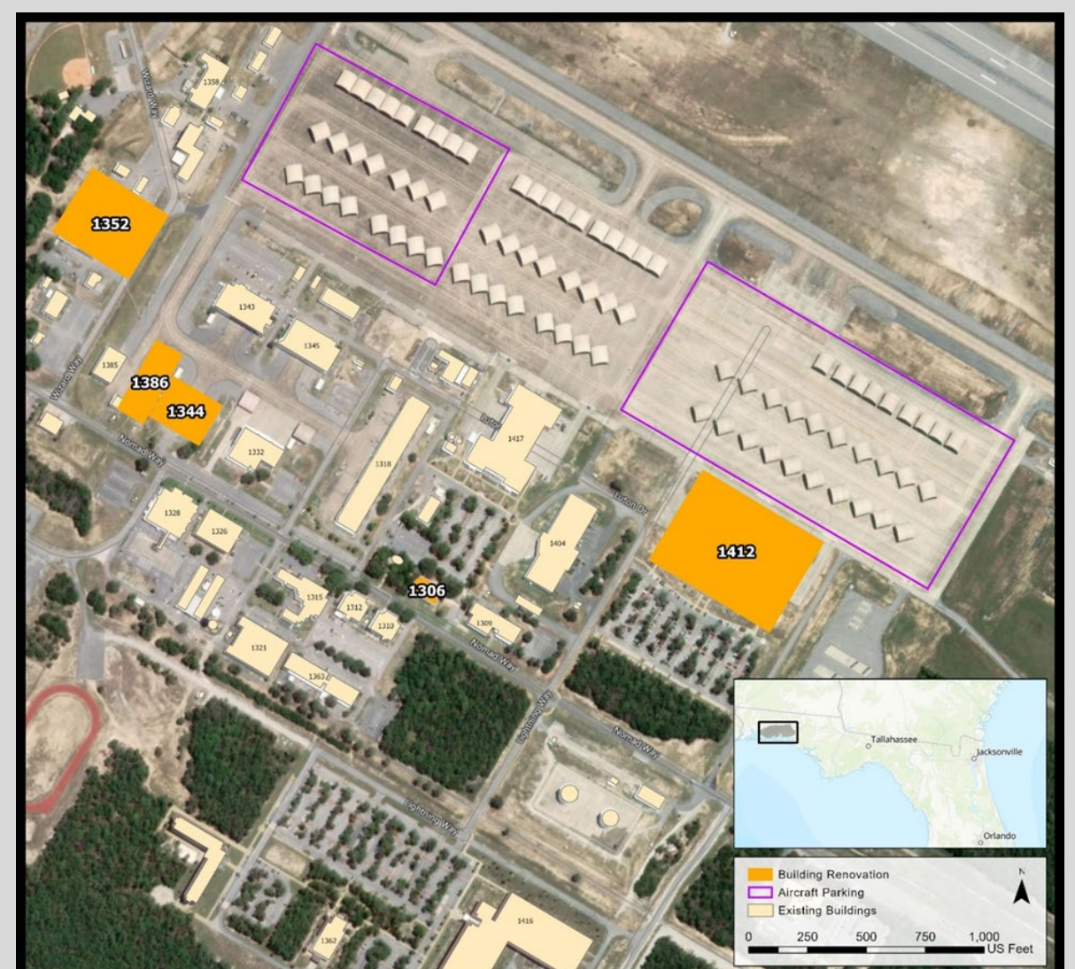
Proposed facility improvements at Eglin AFB